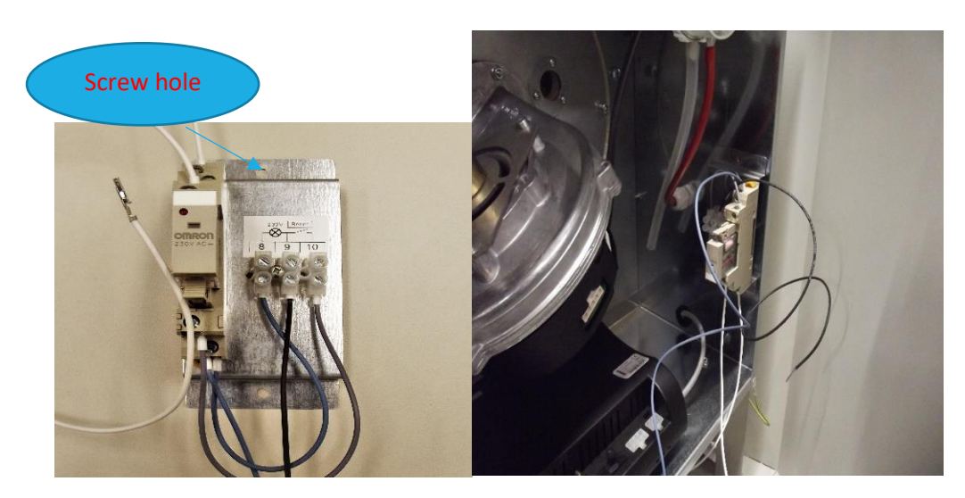
Figure 1: Position relay